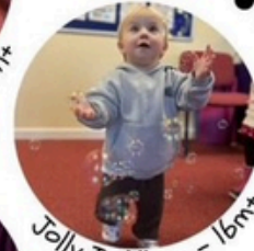
Jolly Toddlers - 16m*