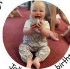
Jolly Babies - birth*