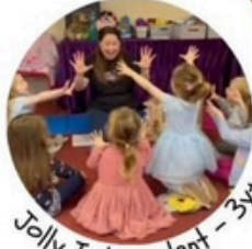
Jolly Independent - 3y*